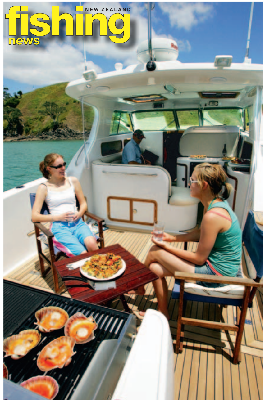
There was plenty of room in the cockpit for both fishing and relaxing.